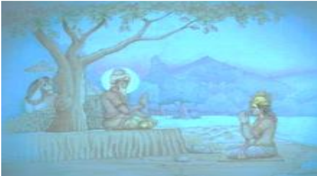
Athri Maharshi releases the curse and blesses Lord Kubera

During the course of his journey he comes to Sethu (present Dhanuskoti). During the walk, he comes across Atri Maharishi and he immediately falls down at his feet and asked for forgiveness.