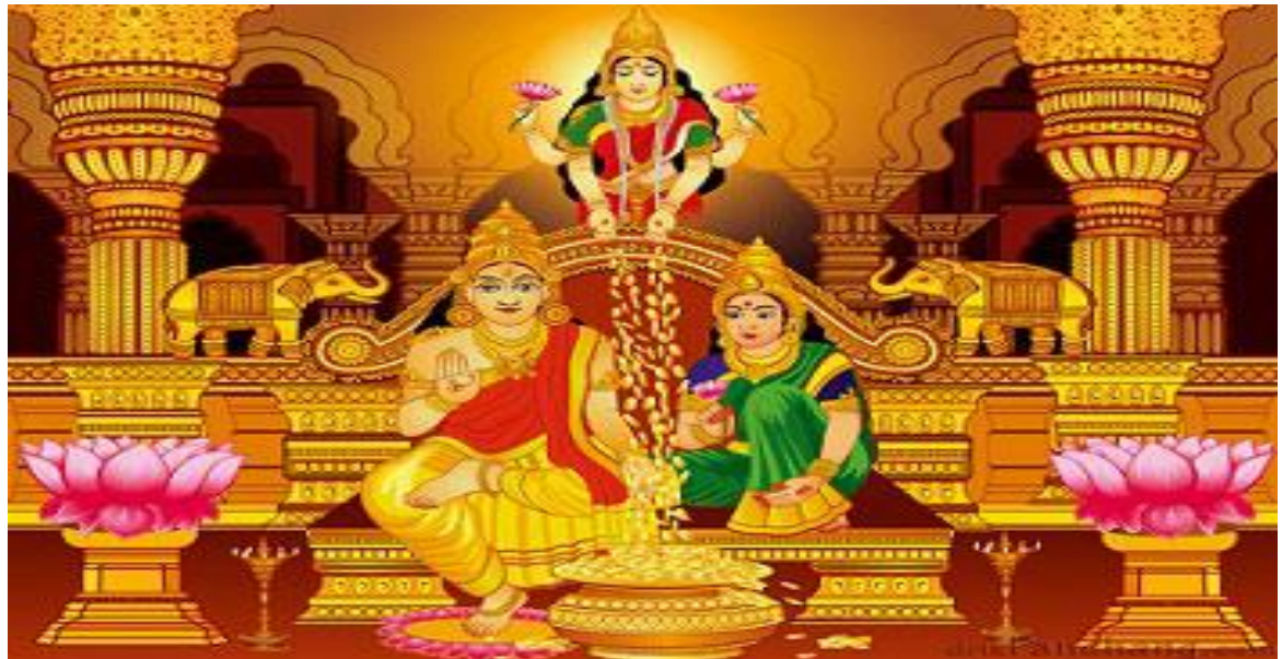
Lord Kubera Borrowing Money from Mahalakshmi