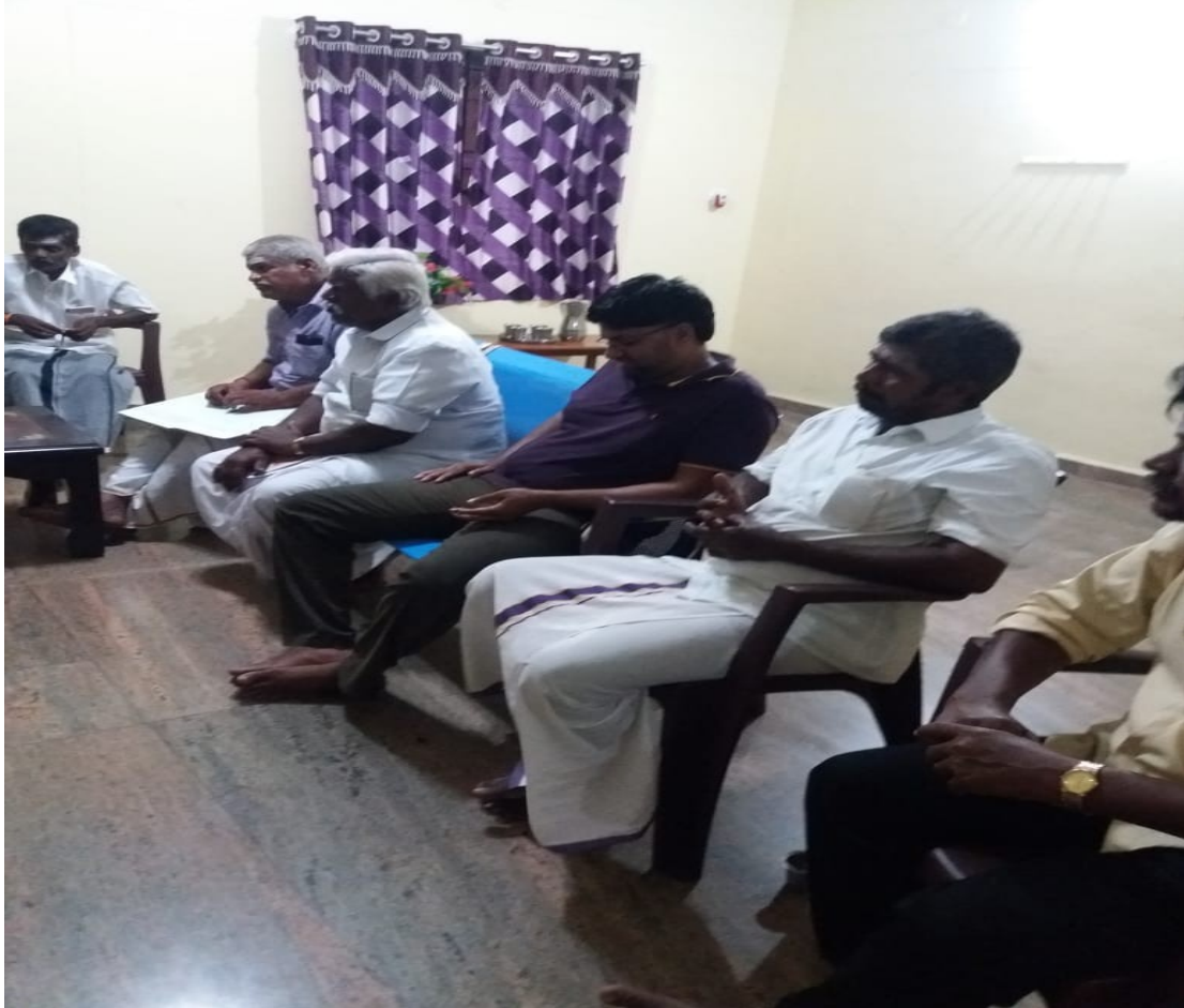
A view of the meeting held at Sri Adichunchanagiri Mutt for maintaining Teerthams (Traditional Water Bodies)

In order to build Teertha Mitras around all the Teerthams a meeting was organized on 18 th November 2018 morning in the premises of Sri Adichunchanagiri Mutt. The meeting was attended by a few local stakeholders including shop owners of Sannathy Street.