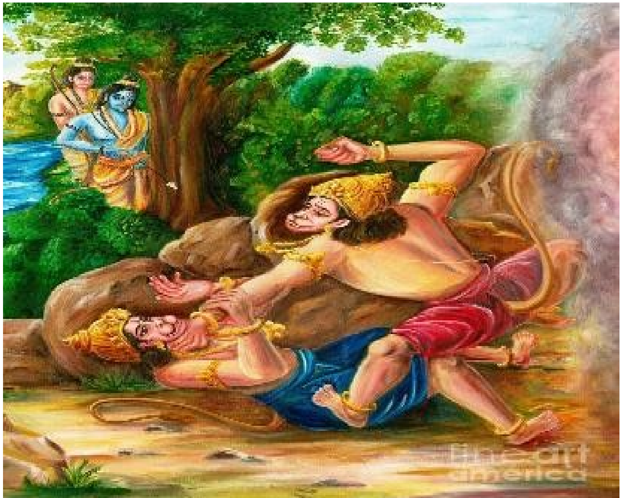
Vali and Sugriva Fight

Sugriva instrumental for his brother Vali's death acquired the sin of killing his own brother. Lord Rama created this Teertham and sugriva did 9 days of Shiva Pooja near this Teertham and had the darshan of Lord shiva in the form of light.