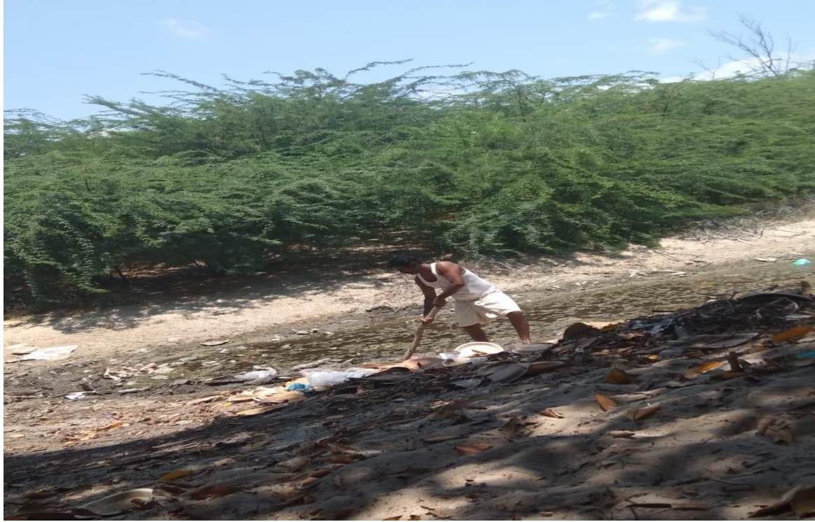
Shri.Muthuramalingam cleaning the Sarabha Teertham