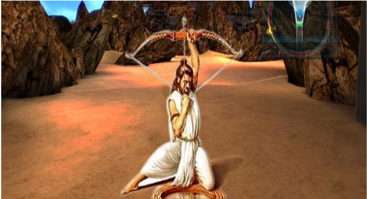
Arjuna Practicing with Bow and Arrow

Arjuna is also one of the Pancha Pandava Teertham. Arjuna has done Tapas using this Teertham along with his brothers to regain wealth. It is also said that this Teertham is good for cleansing Sins and regaining power. Doing Dharma in the banks of this Teertha gives multifold Punya.