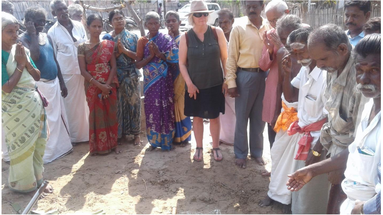
Stakeholders and guests praying for the success of the venture