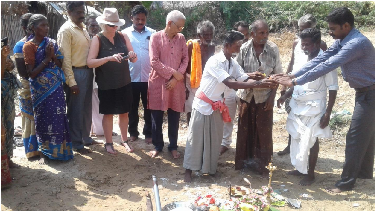
Traditional Pooja is on ....