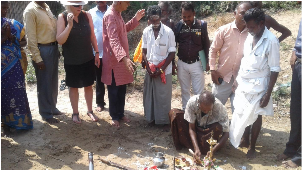
Construction worker doing pooja of Trowel - construction material