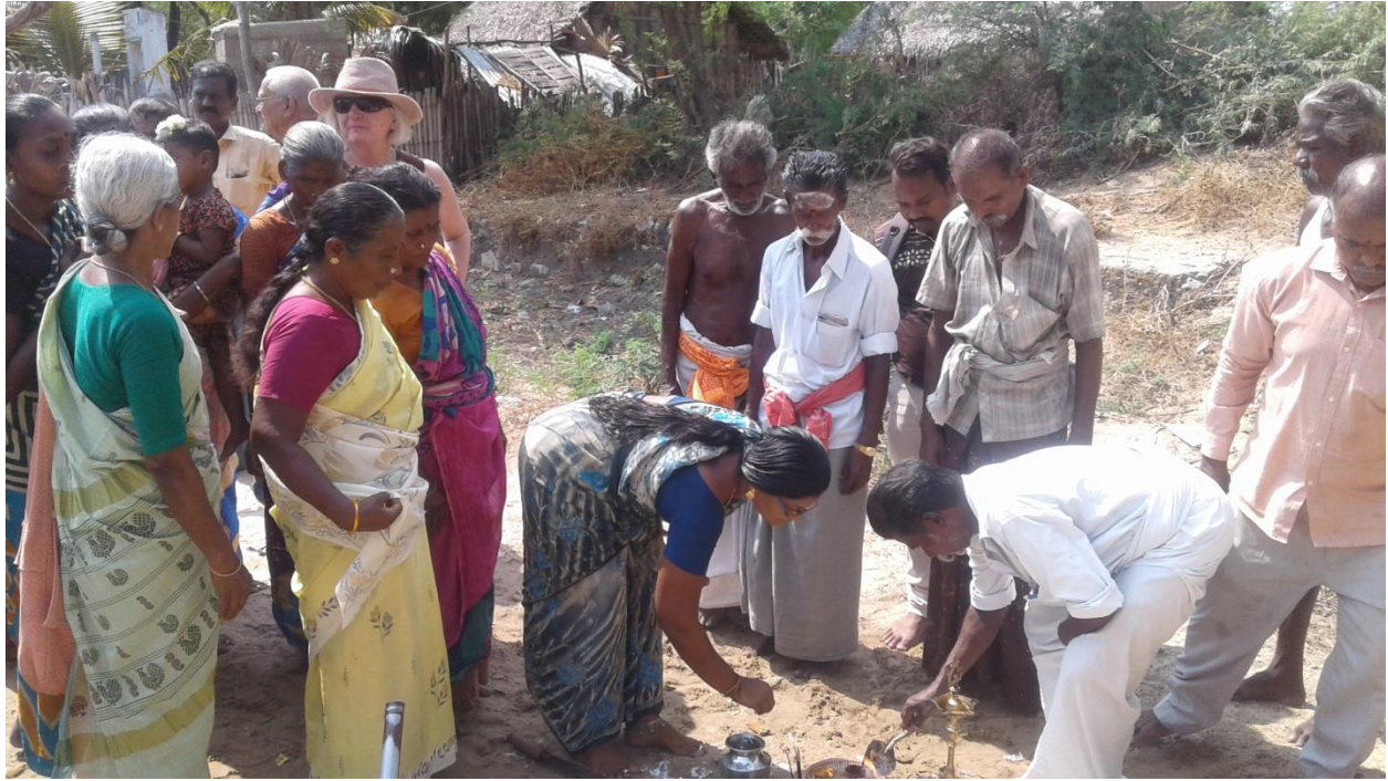
Village Women performing Pooja by offering flowers