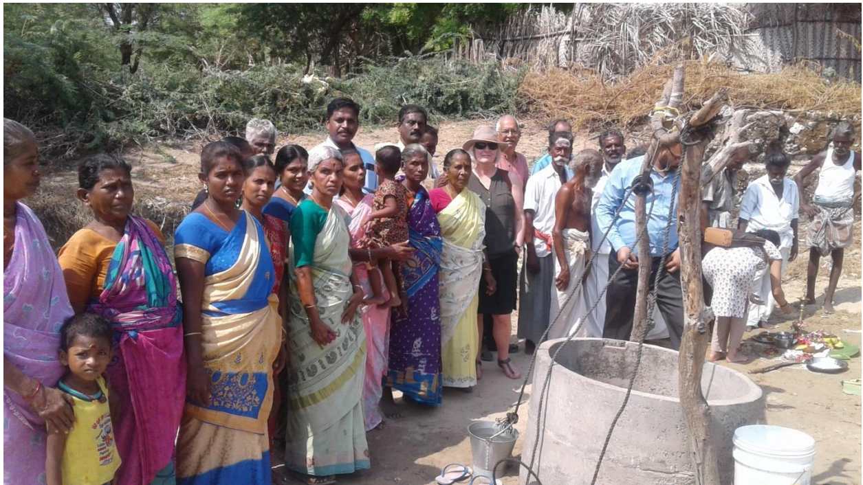
Village group posing for photograph