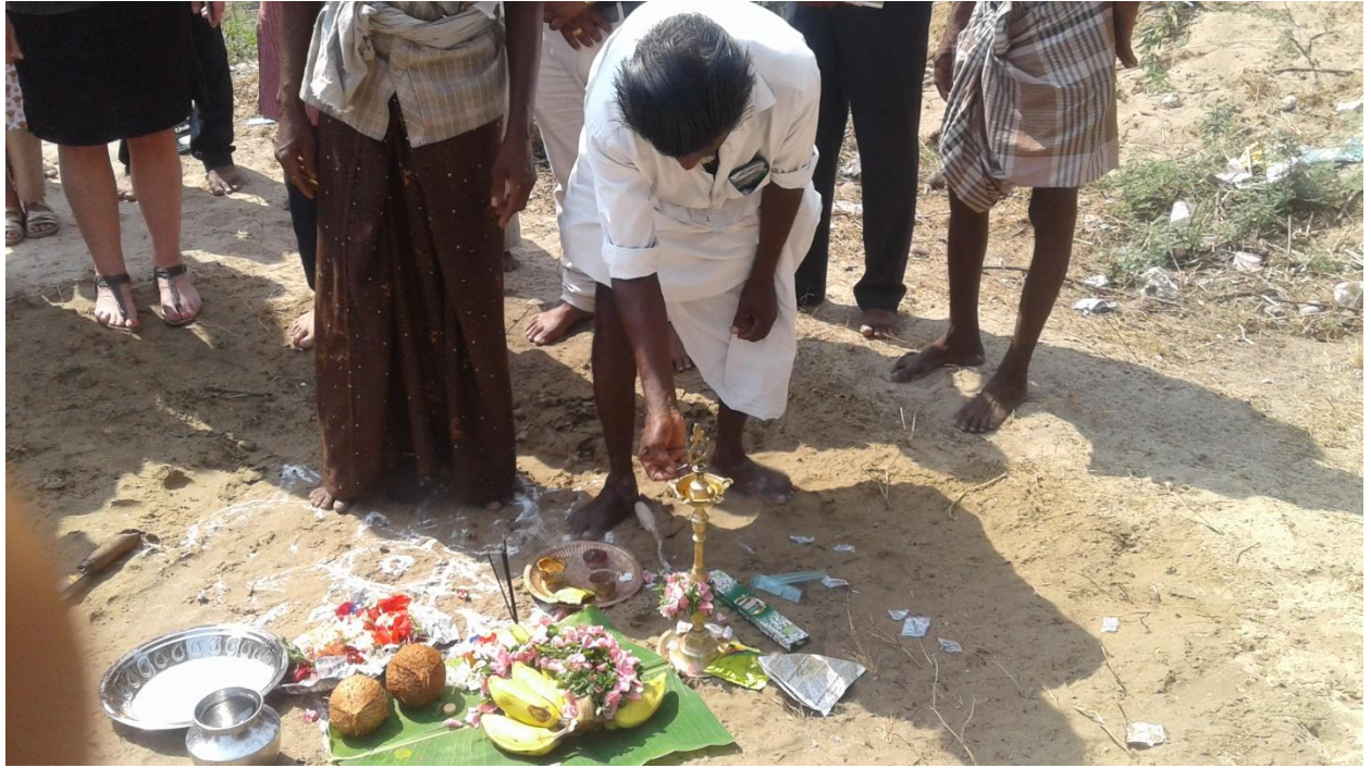
Villagers lighting the lamp