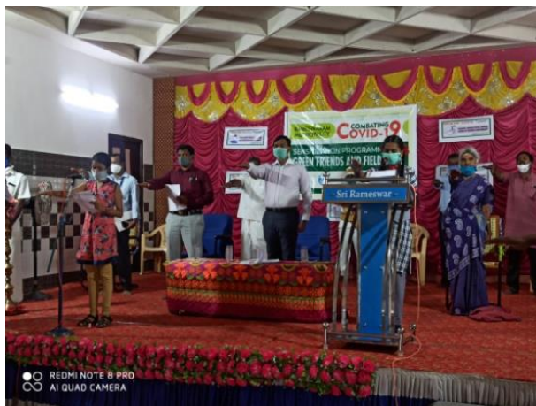
Collector addressing the gathering