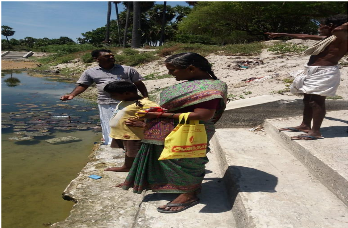
Visit to the Saathakone village along with team members

On October 25, 2020 a Focused Group Discussion took place in the village and then the team went around the Teertham. Everybody sensed the archaeological importance of the site and felt that it will be an important milestone.