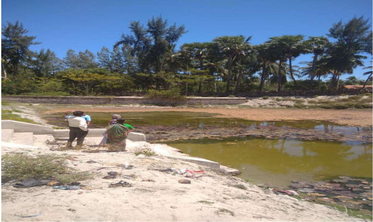
Green Rameswaram Team along with VAO and other revenue officials inspecting the site