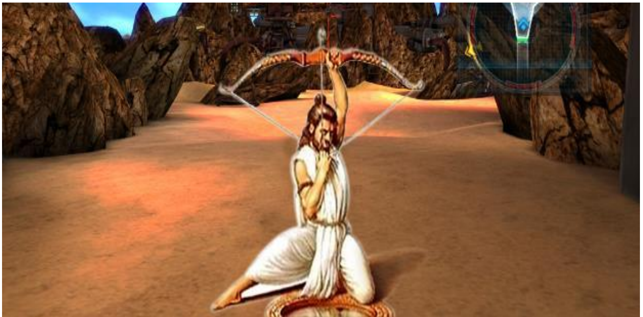
Arjuna Practising with Bow and Arrow

Arjuna has done an intense Tapas using this Teertham along with his brothers to regain wealth. It is also said that this Teertham is good in terms of cleansing Sins and regaining power. Doing Dharma in the banks of this Teertha gives multifold punya.