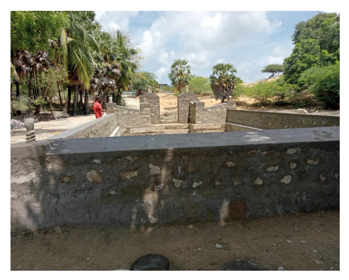
Long distance and short distance photographs of the holy Veera Teertham