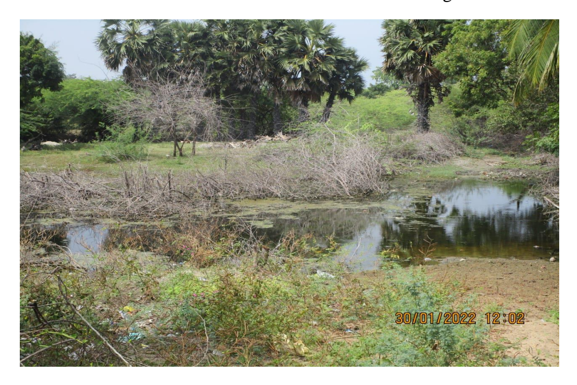
Old water body in a bad shape

Vivekananda Kendra – Nardep decided to preserve and improve the adjacent water body by cleaning the entire area and giving a proper shape to the old water body by using JCB etc. The new body looks beautiful with perennial water which will be useful to the cattle as well as birds during the hot summer.