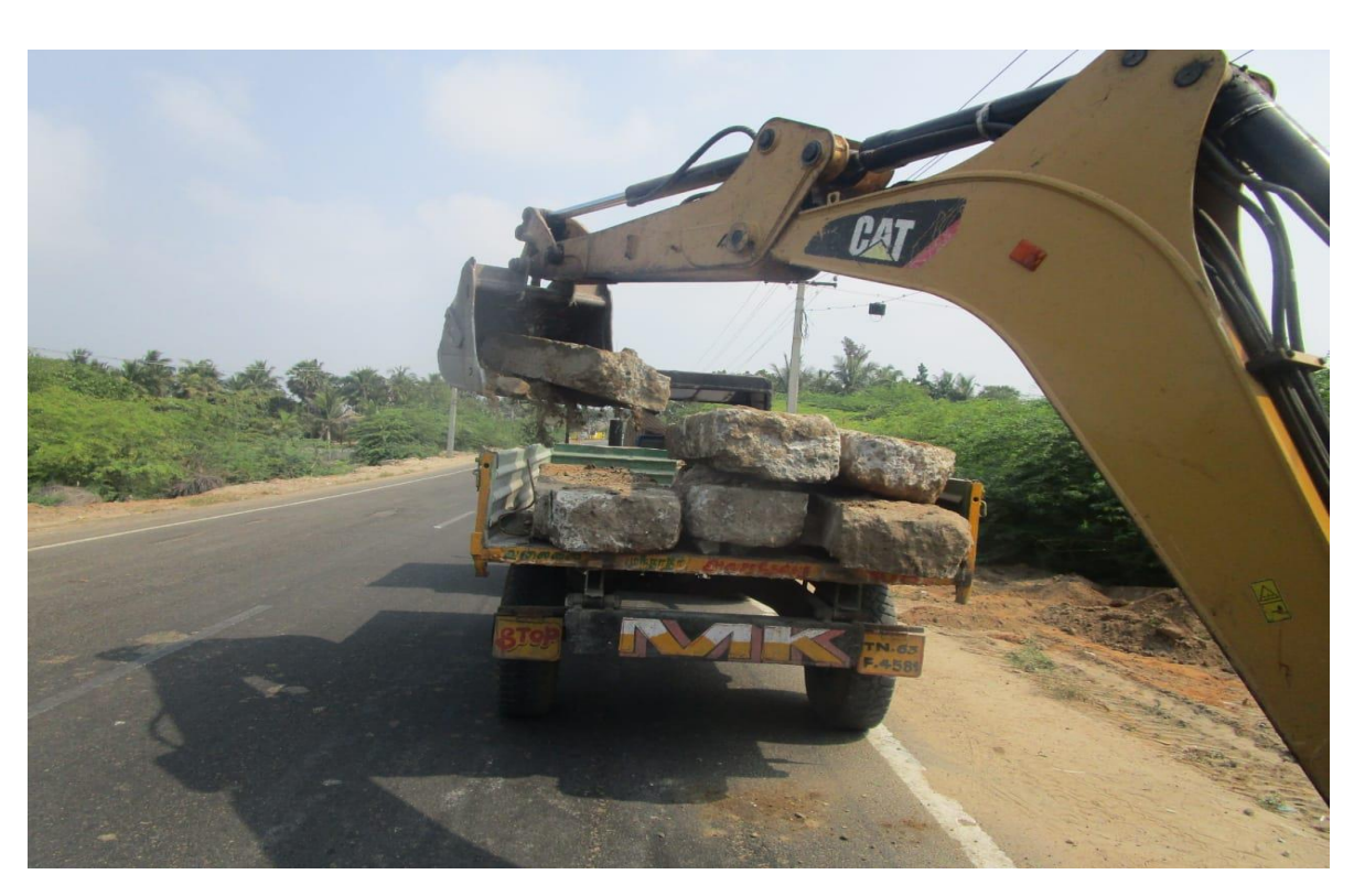
Use of old stones in renovating the Traditional water body – Veera Teertham Recycling of material