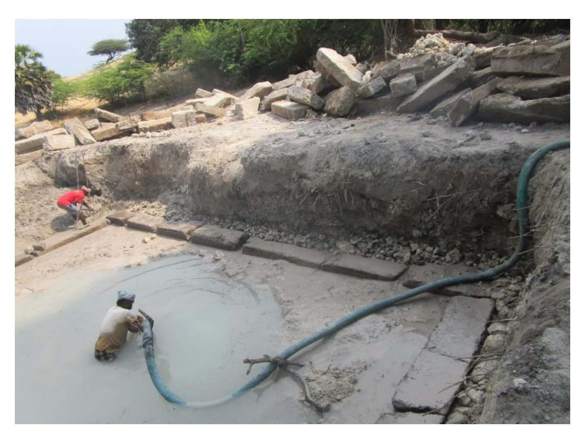
Pumping out the water for further construction