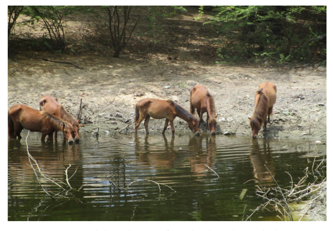
Ponnys relishing the water from the cleaned water body