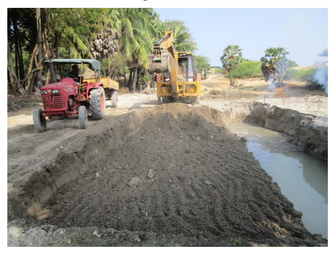
Making of approach road to the proposed Veera Teertham