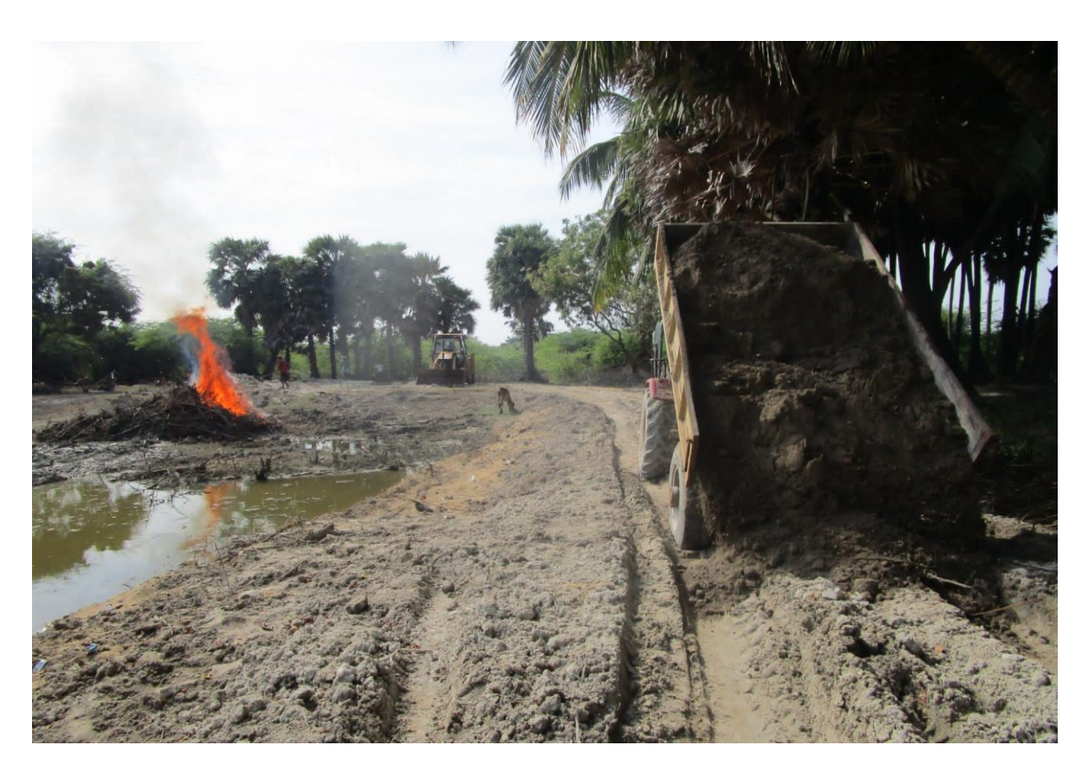
Approach road is passing through an adjacent water body which is used by the cattle