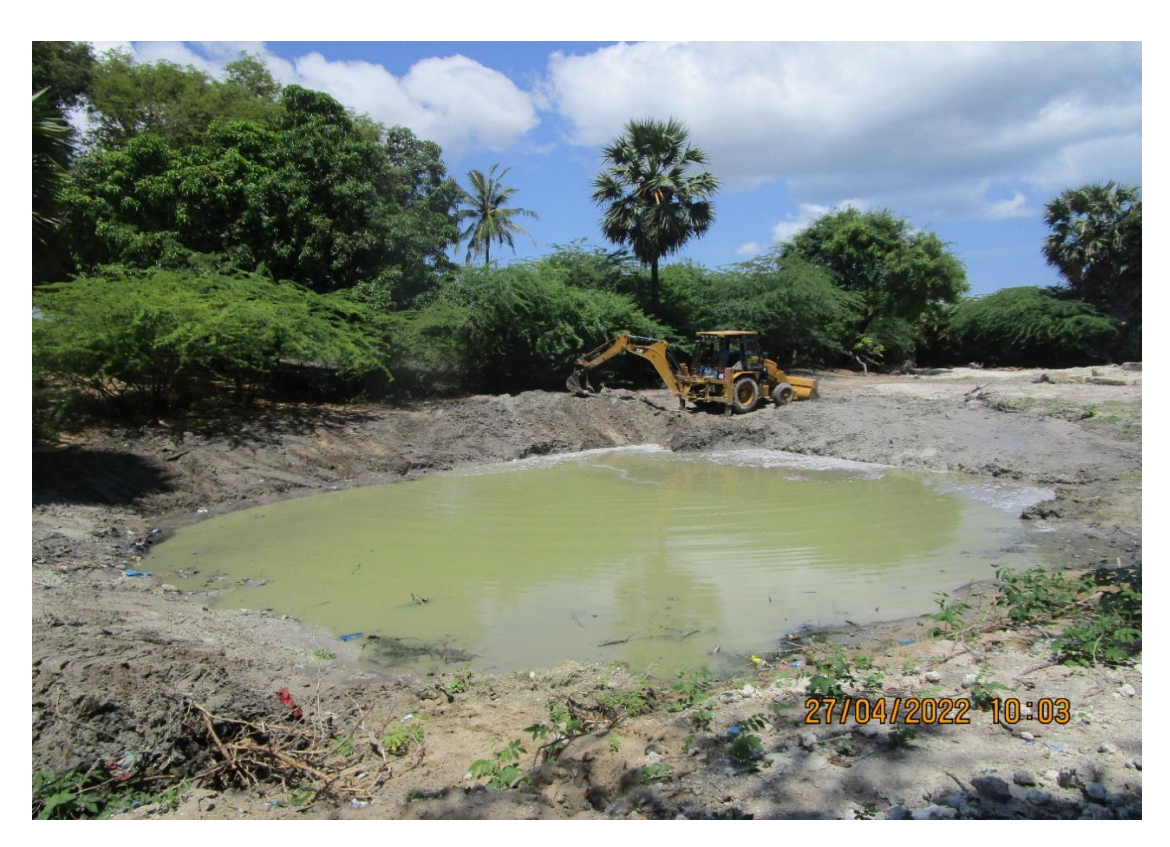
Levelling of the area and bunding to give proper shape to the water body