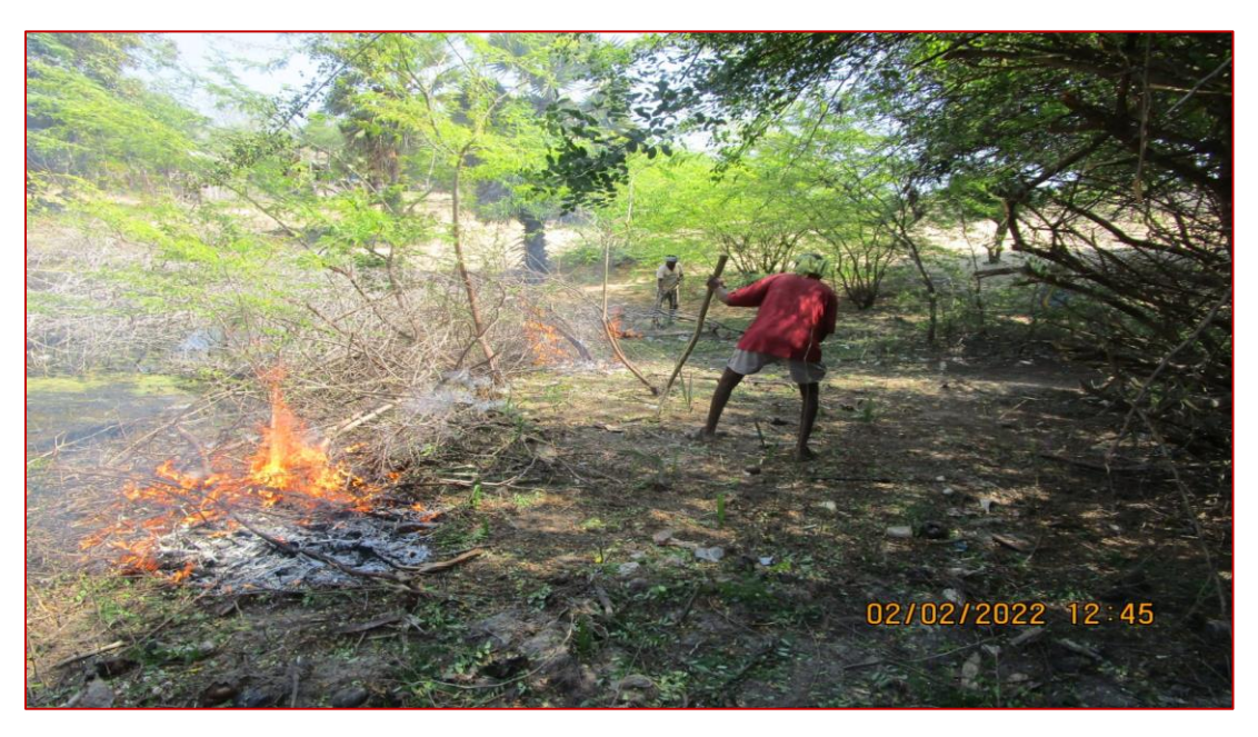
Cleaning the shrubs for carrying out the survey properly

Veera Teertham renovation works which commenced in the month of March completed by the end of April. Now it is waiting for formal inauguration and worship.