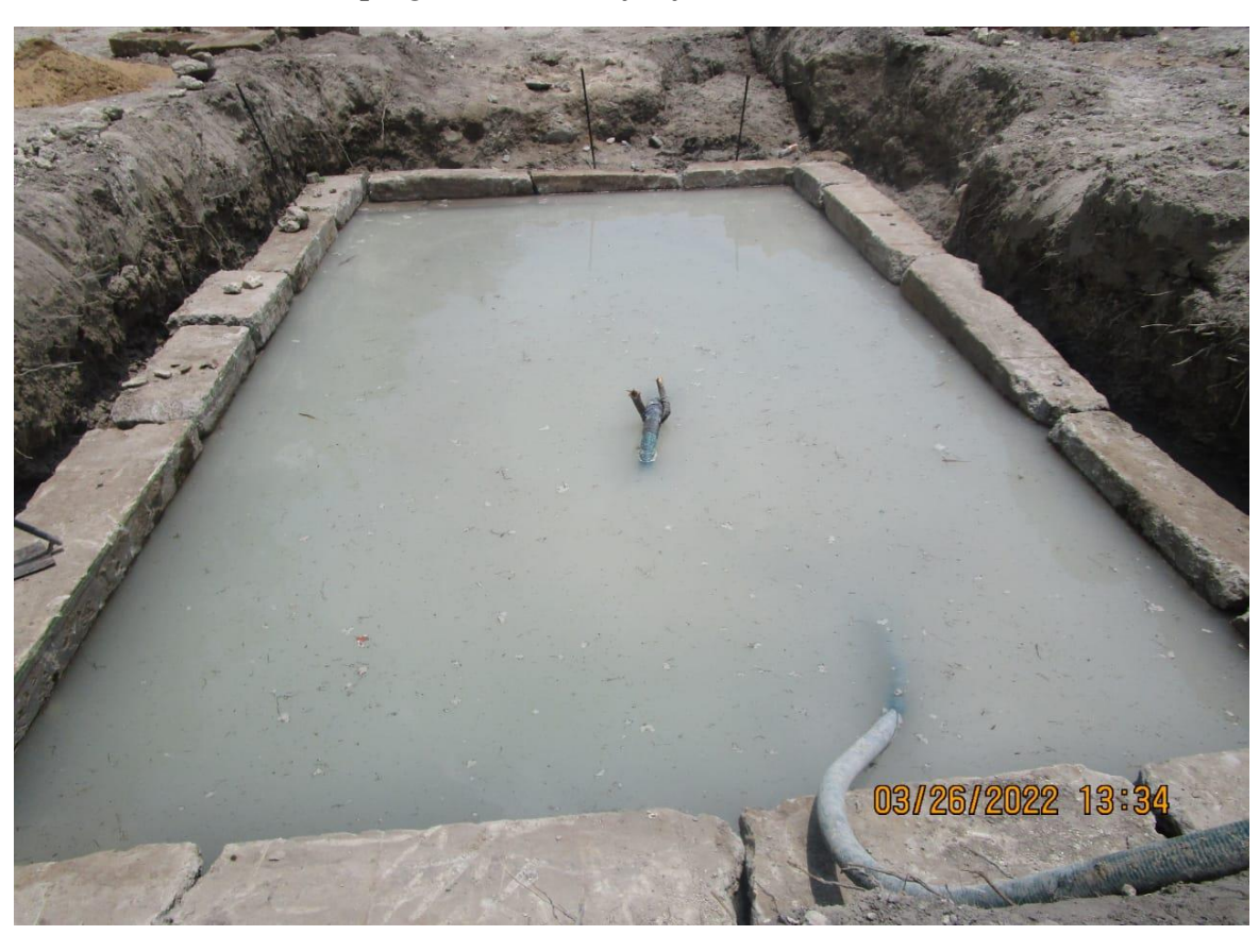
Wooden poles standing majestically in the water body – provision for keeping the submergible pump properly