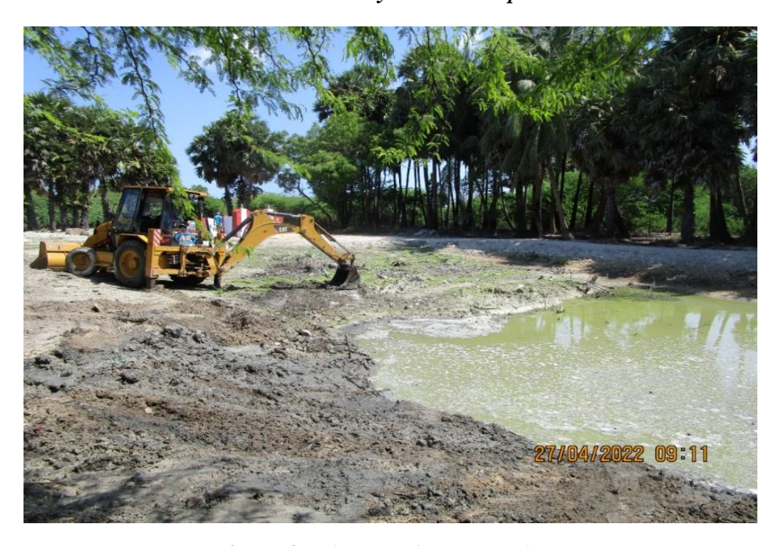
Use of JCB for cleaning the surrounding area