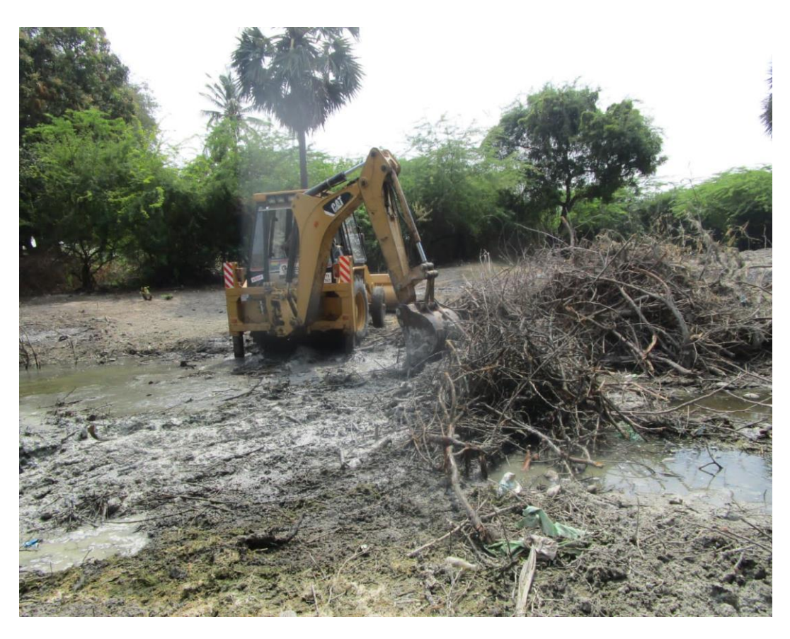
Cleaning the area with JCB