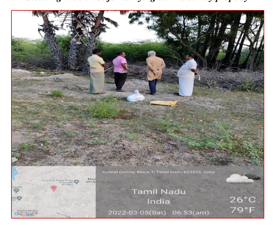
Site inspection is on ....