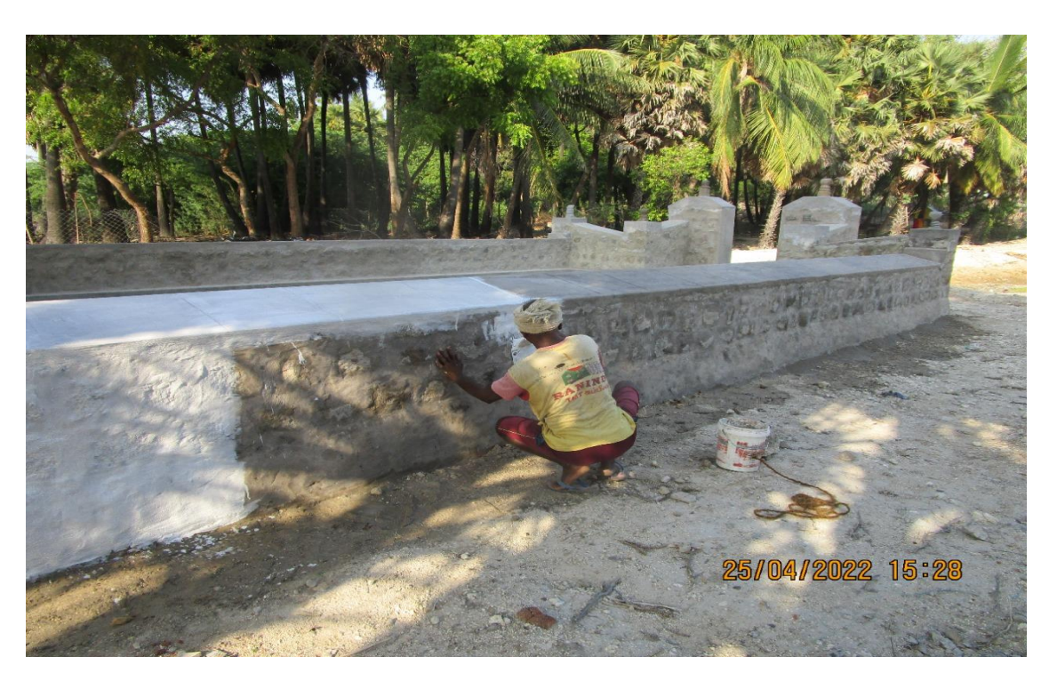
White Washing is on .....