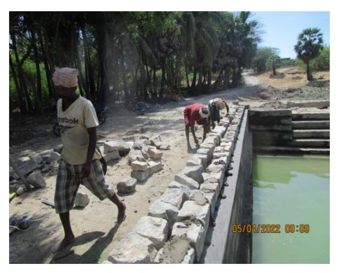
Construction of parapet wall ....