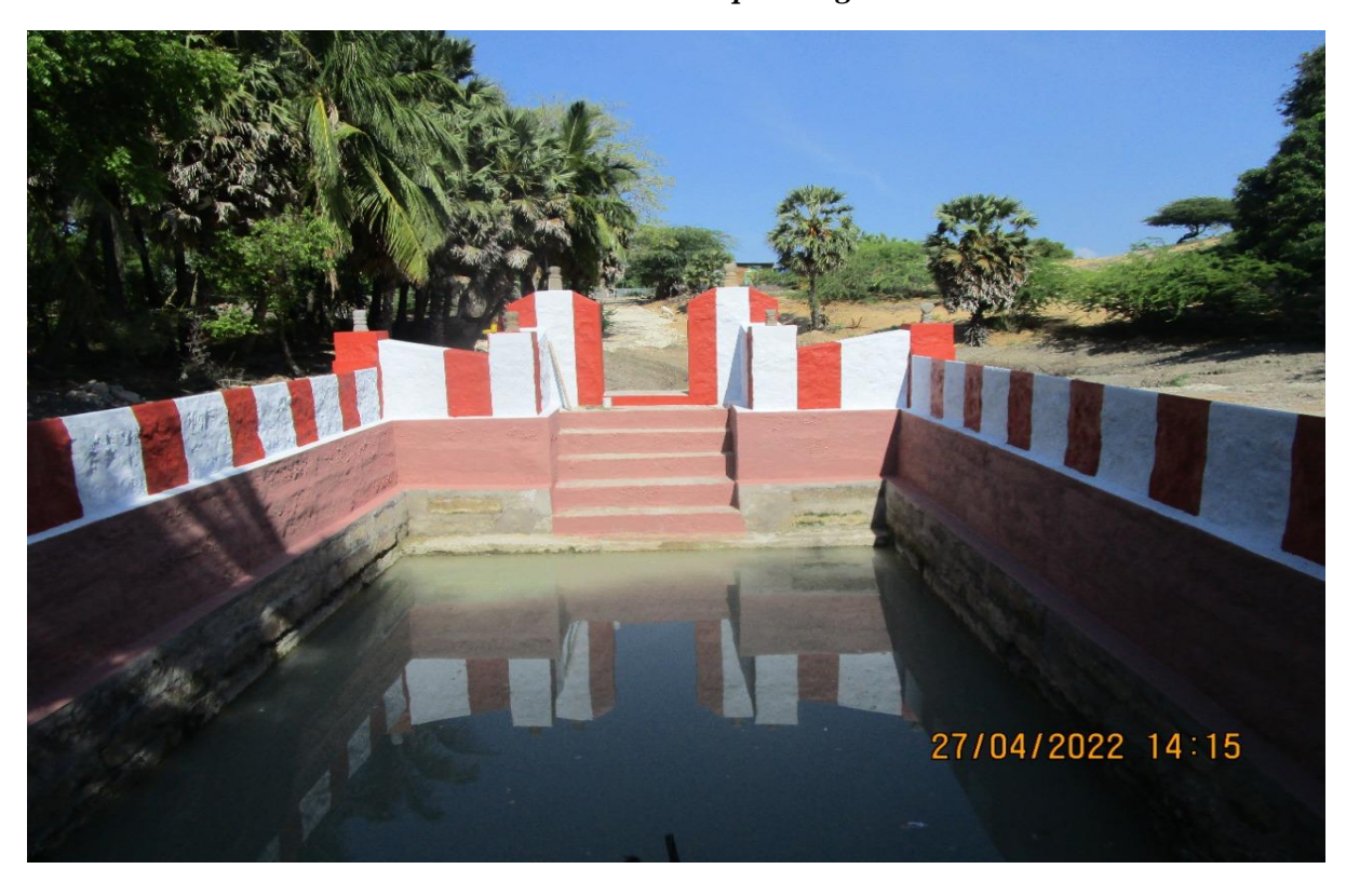
Fully completed Veera Teertham – waiting for inauguration