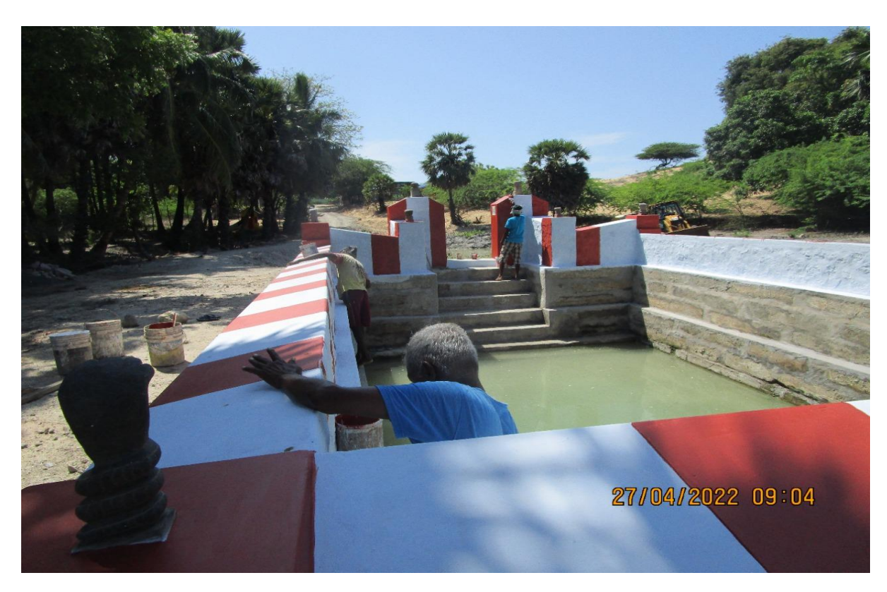
Traditional Kavi painting