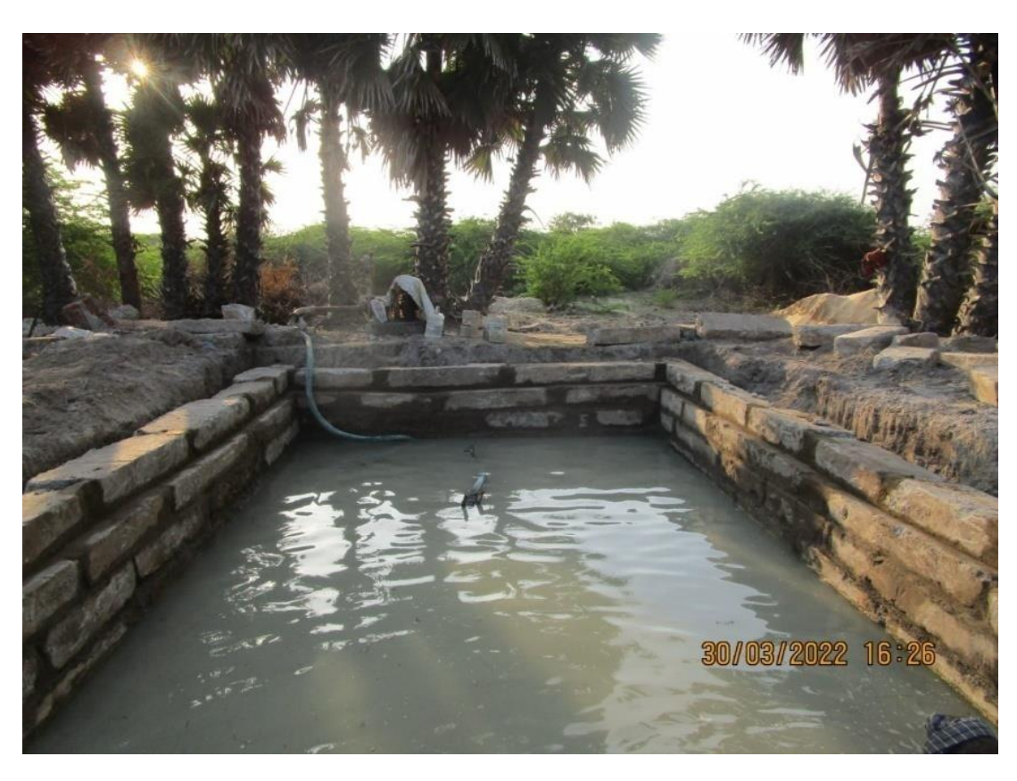
Slowly and gradually the Teertham is taking shape