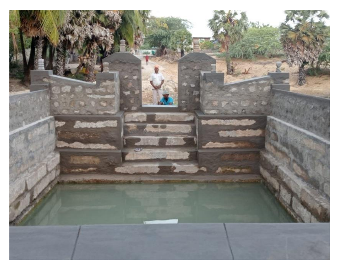
Entry to the Veera Teertham with a beautiful gate and steps