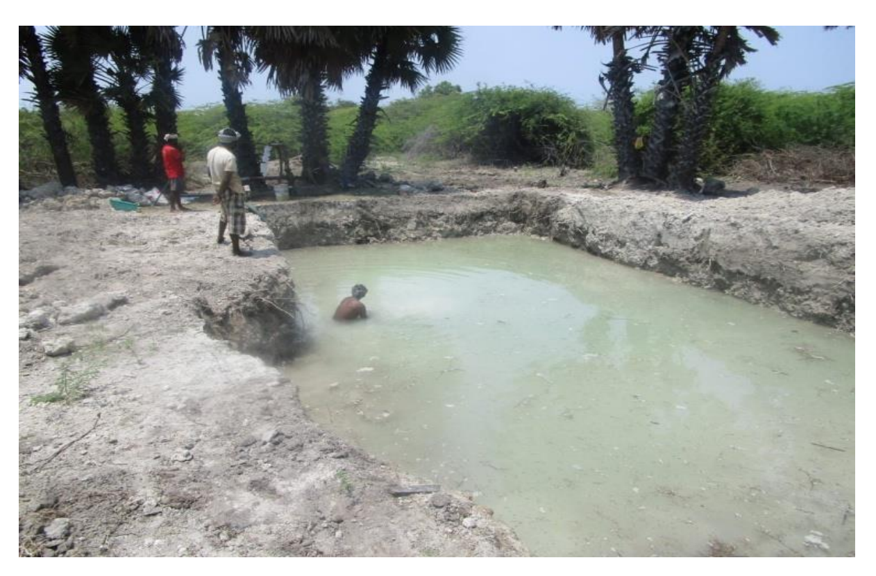
Veera Teertham is full of water after excavating the area