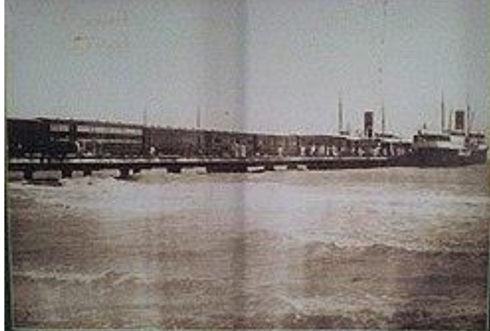
PASSENGERS ARRIVED BY FERRY STEAMER FROM CEYLON CHANGING INTO THE MADRAS BOAT MAIL AT DHANUSHKODI PIER