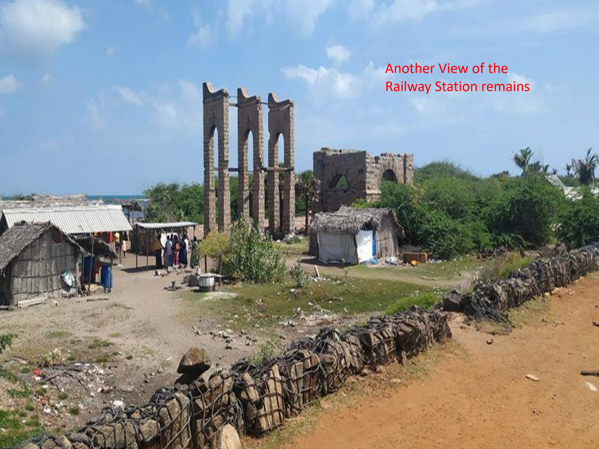
Another View of the Railway Station remains