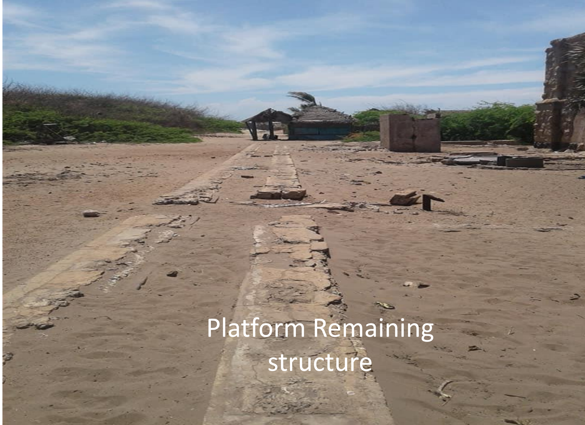
Platform Remaining structure