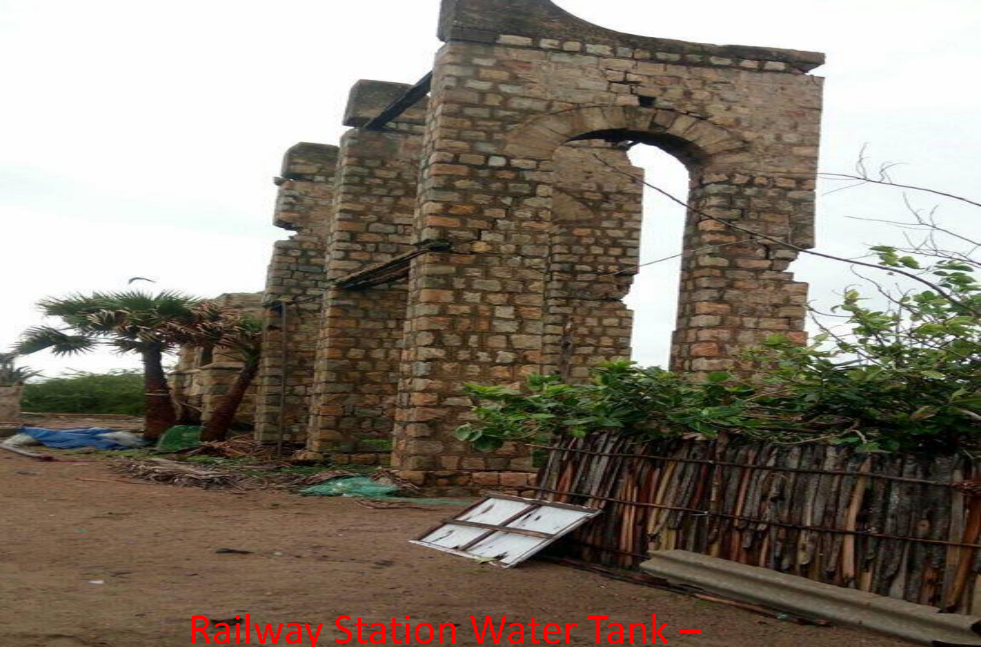
Railway Station Water Tank – Broken structure