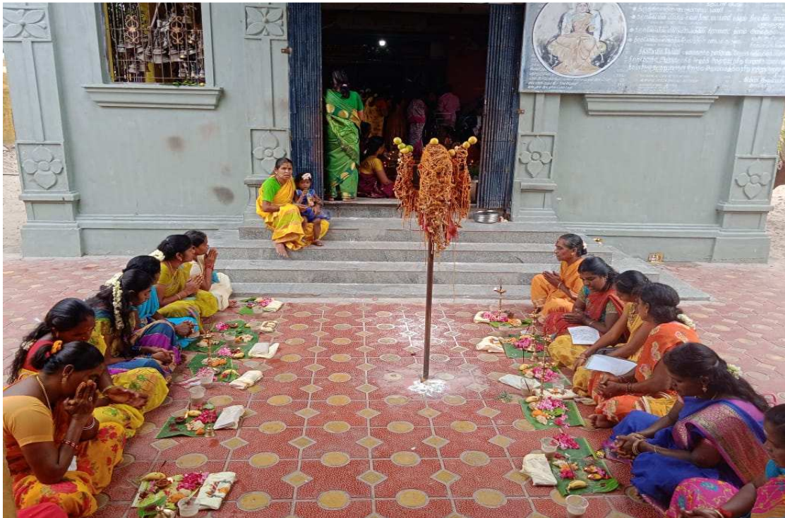
Teertha pooja at the temple near Amutha Teertham