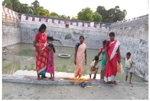
Teertha pooja at Arjuna Teertham