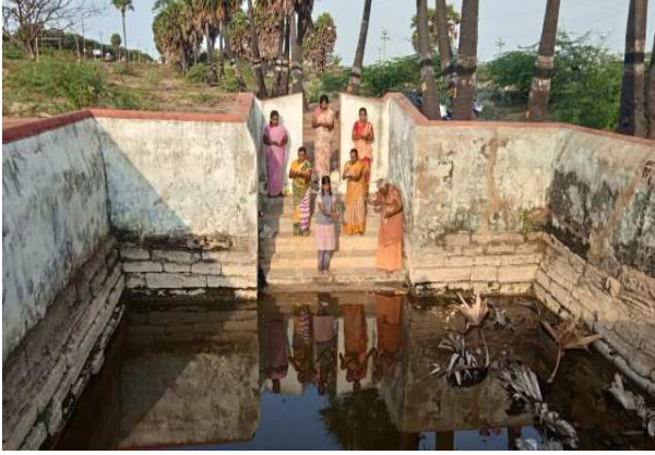
Teertha pooja at Papavinasaka Teertham