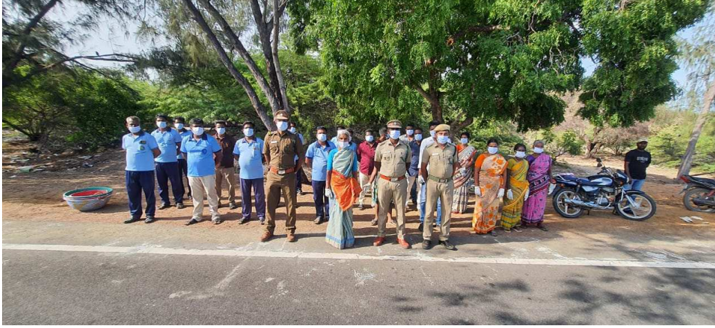
Team is getting ready for the work

Event was organized by Forest Department and Green Rameswaram participated in it on 03 July 2022.