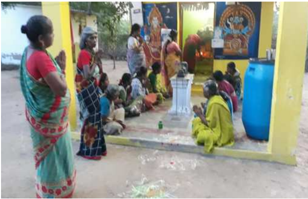
Teertha pooja at Jhambavan Teertham