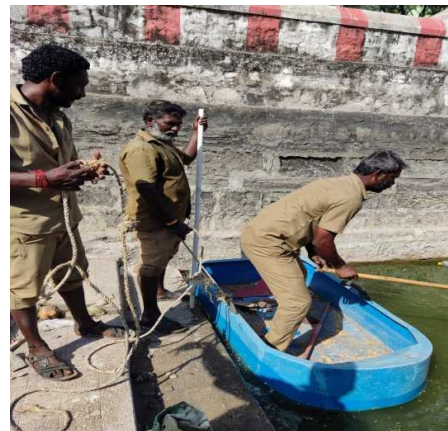
Workers moving in a small boat to clean the Teertham