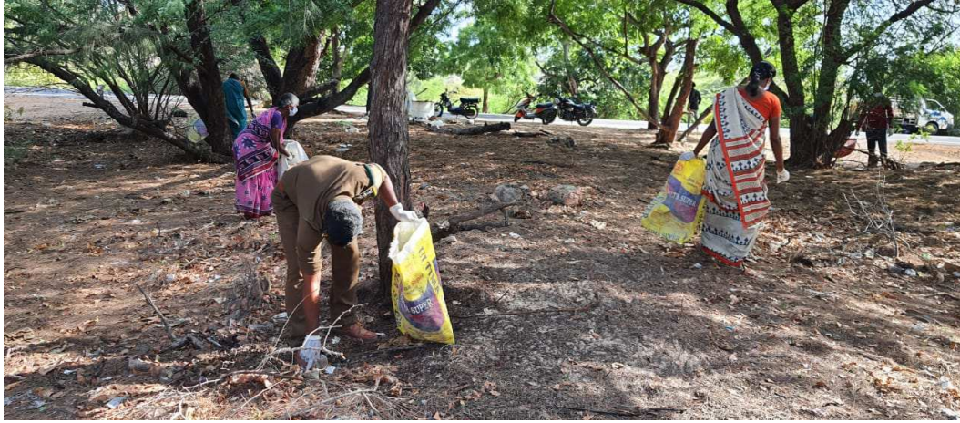
Cleaning the coastal area is on ...