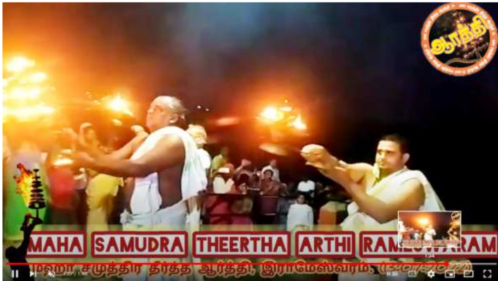
Teertha pooja at Agni Teertham