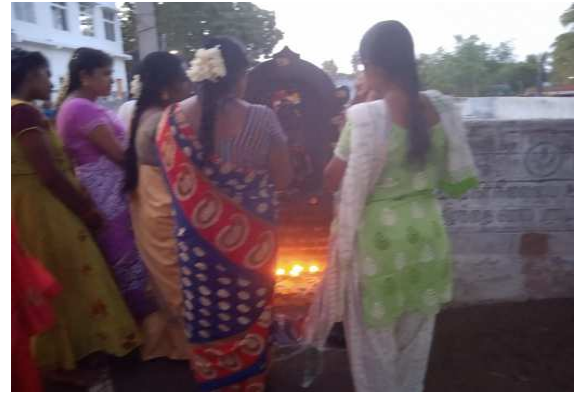
Teertha pooja at Hanuman Teertham