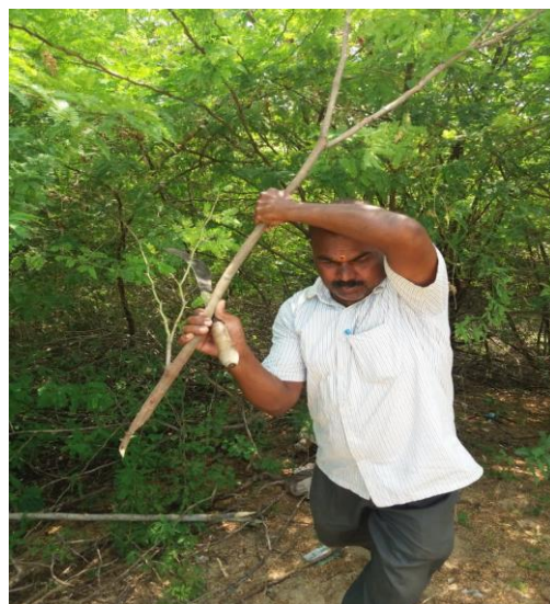
Krishna Teertham cleaning