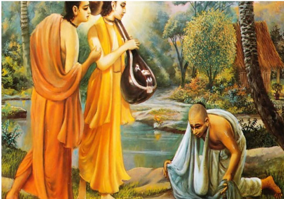
King getting the advice from the Saint to do poojas in Mangala Teertham

Another Puranic story states that, the King Manojavar belonging to the Lunar race has lost his kingdom and was roaming as a nomad. During his Journey, he met Saint Parasara and as per his advice, the king took bath in Mangala Teertham and did penance near the Teertham for three months to get back his Kingdom.