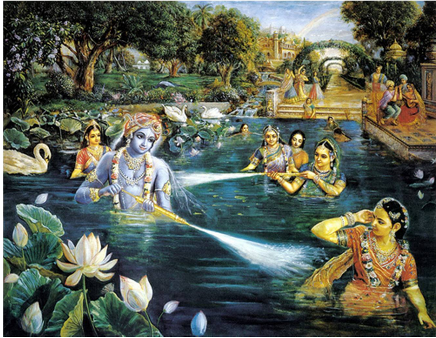
Lord Krishna taking bath along with the Gopis in the Mangala Teertham

Another Puranic story states that, the King Manojavar belonging to the Lunar race has lost his kingdom and was roaming as a nomad. During his Journey, he met Saint Parasara and as per his advice, the king took bath in Mangala Teertham and did penance near the Teertham for three months to get back his Kingdom.