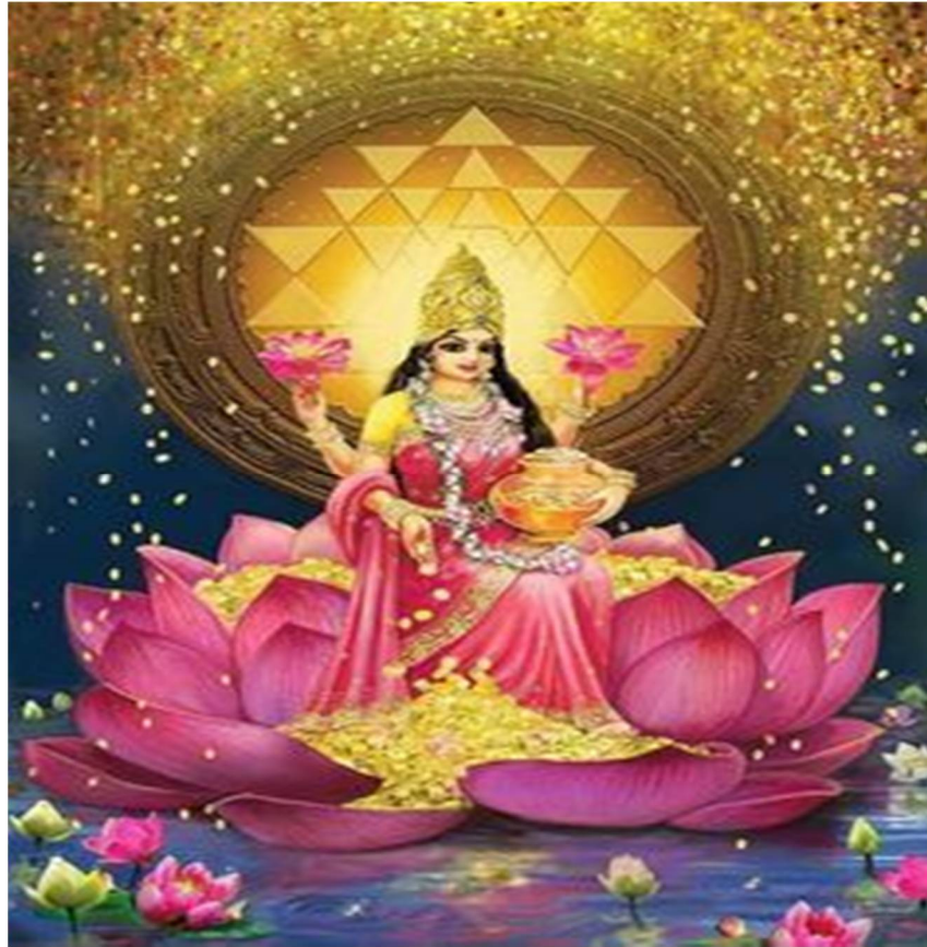
Goddess Lakshmi merges with the Lotus Flower in the Mangala Teertham

During the reincarnation of the world, Lord Brahma prayed Goddess Lakshmi to bestow Mangalam to all his creation in the world. Goddess Lakshmi accepted gracefully and then merged with the Lotus located in the Mangala Teertham. It is also believed that all the Gods took bath in the Mangala Teertham.