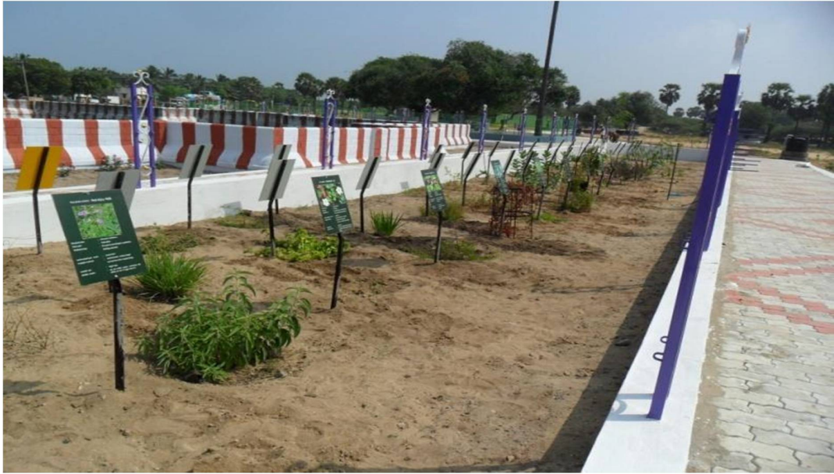
View of Mangalavanam

The then District Collector Shri.Nandakumar IAS, Ramanathapuram District used to visit Mangalavanam quiet often to see the progress of the work and to encourage the stake holders.