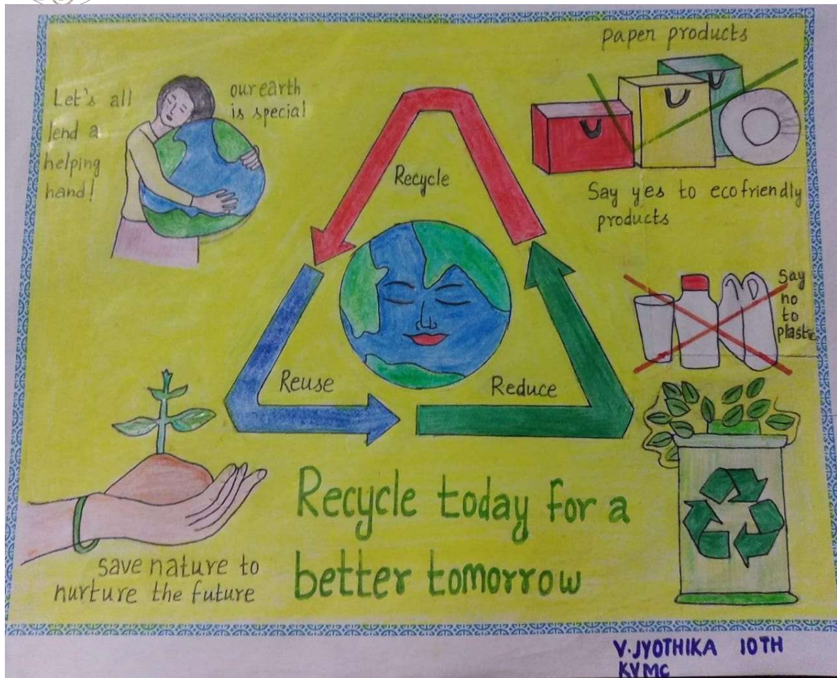
V.Jyothika, 10 th Std, KV, Mandapam