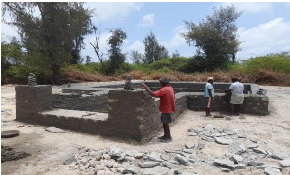
Installation of Snake God Idols