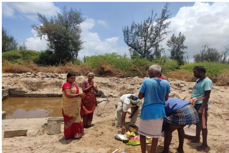
Traditional Bhoomi Pooja at Jatayu Teertham