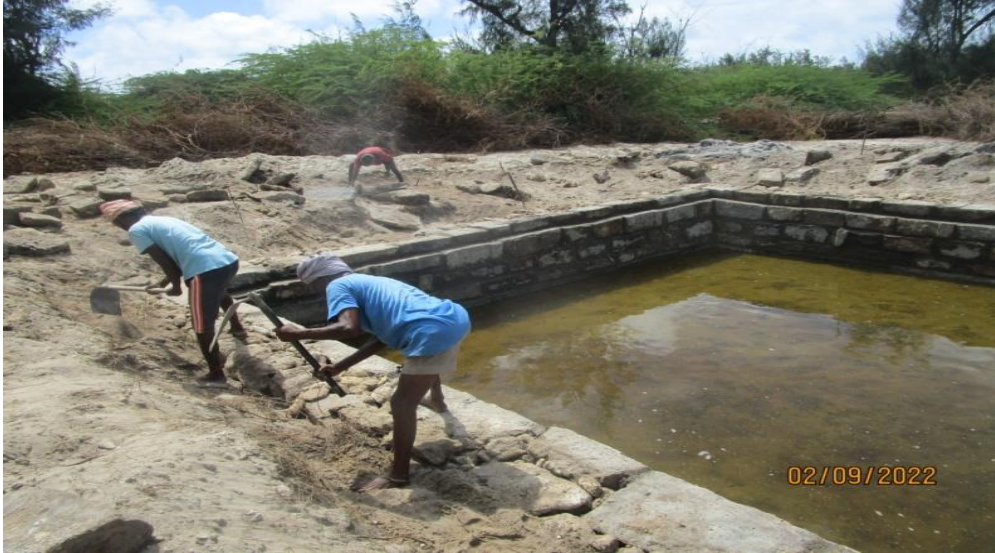
Strengthening Side walls