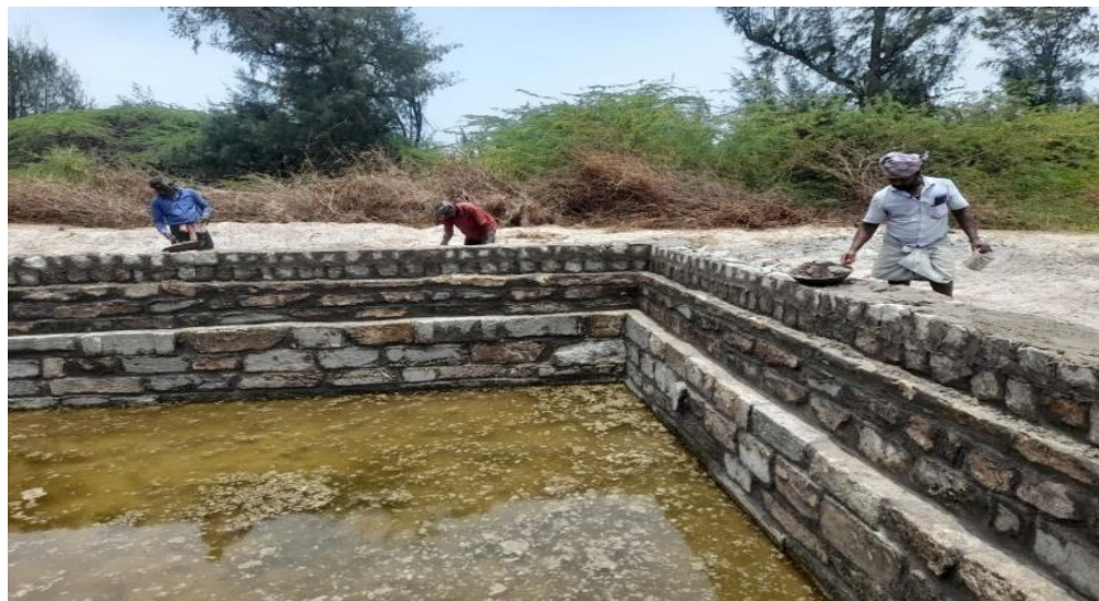
Raising the Parapet walls