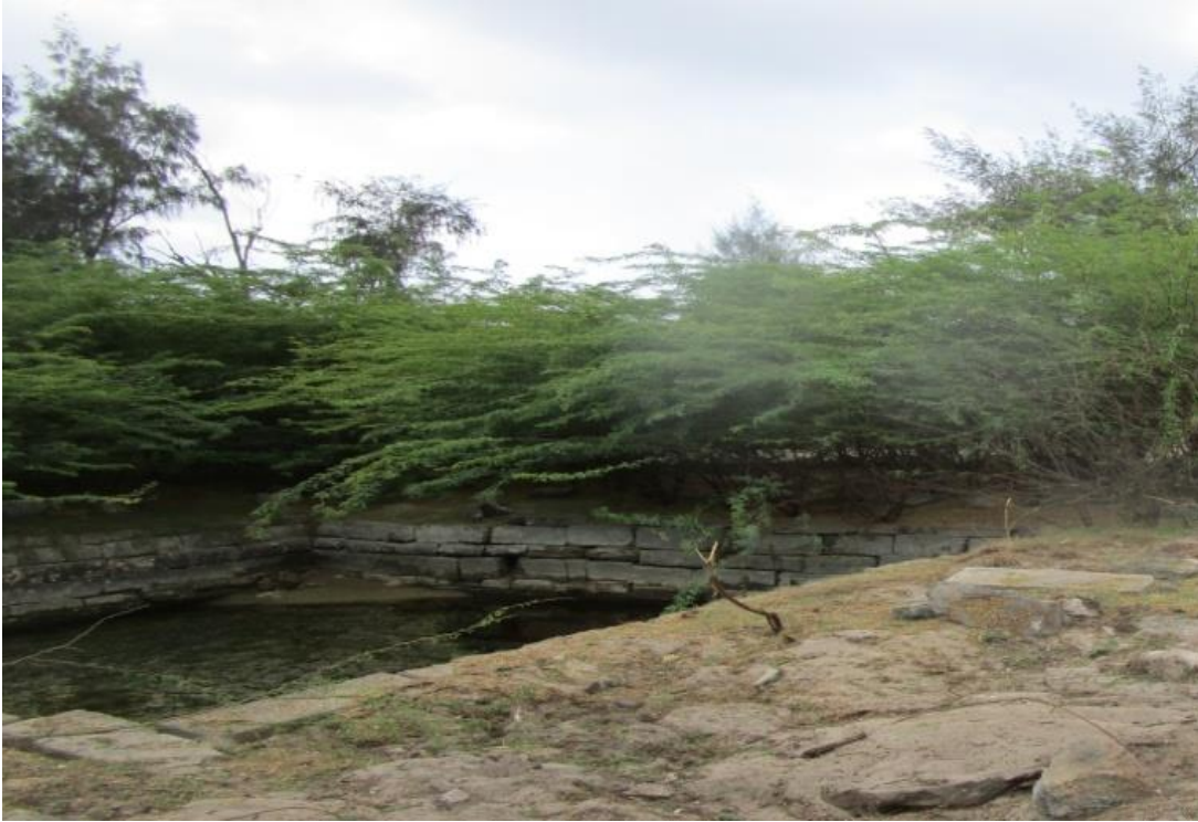
Teertham before Renovation