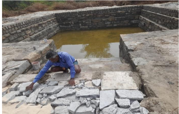
Repairing the steps