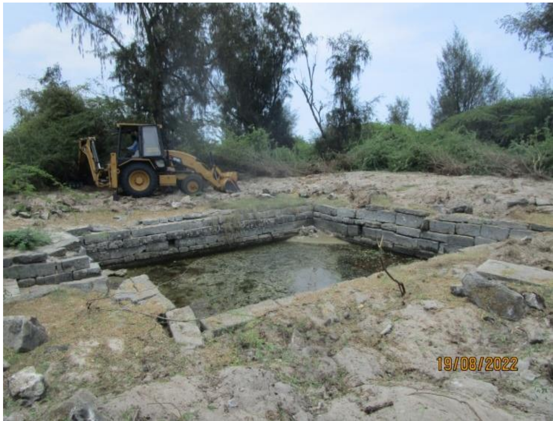
Clearing thorny bushes