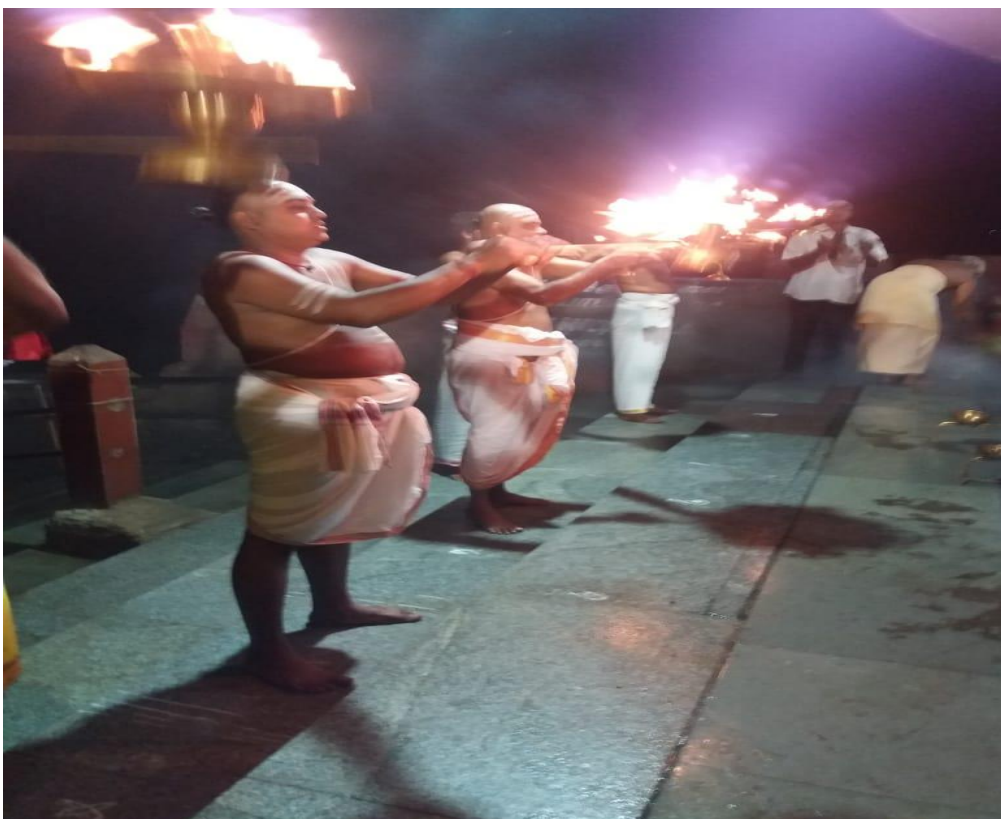
View of Agni Teertham Teertha Pooja

On 13, September 2019, Teertha pooja was conducted at Agni Teertham(150 people) and Kapi Teertham(30 People).