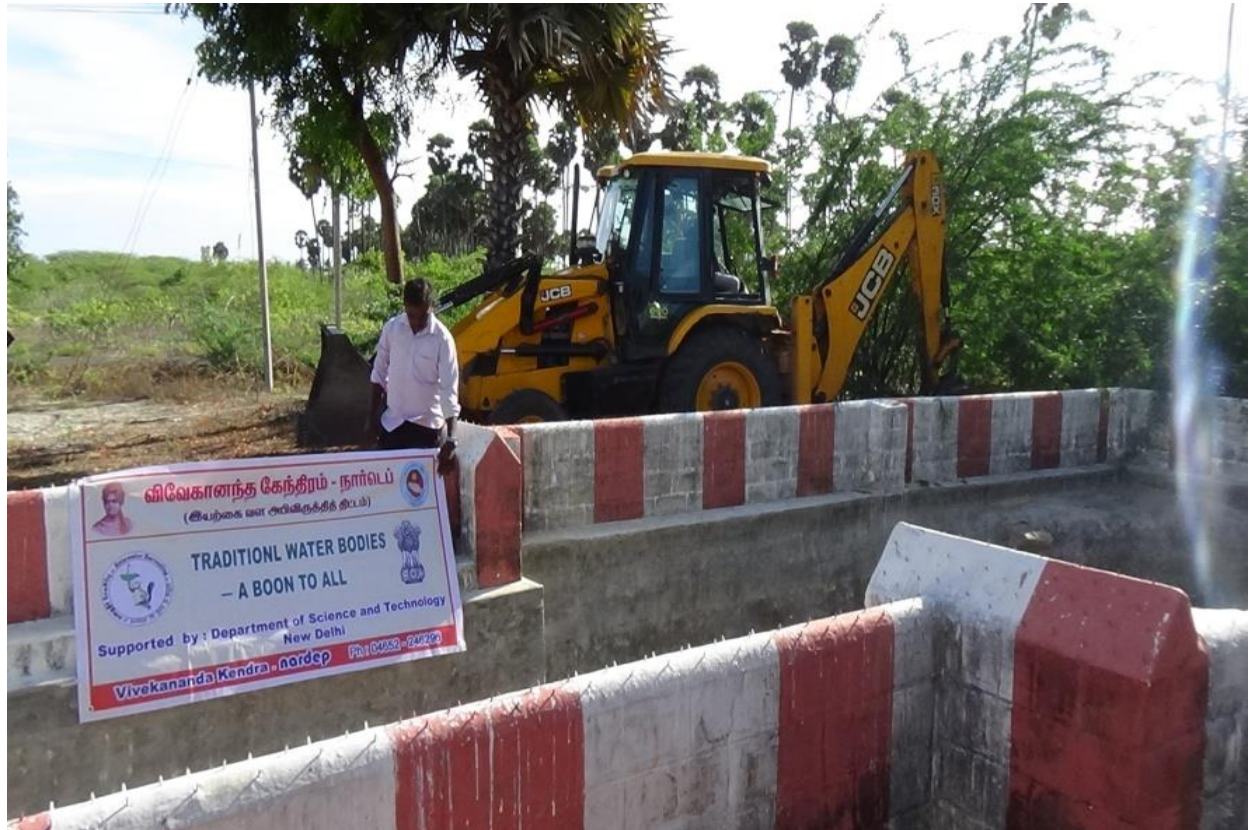
Traditional water bodies cleaning at Gnanavapi Teertham

With the support of 20 Erakadu villagers mass cleaning carried out in Gnanavapi Teertham on September 19, 2019.