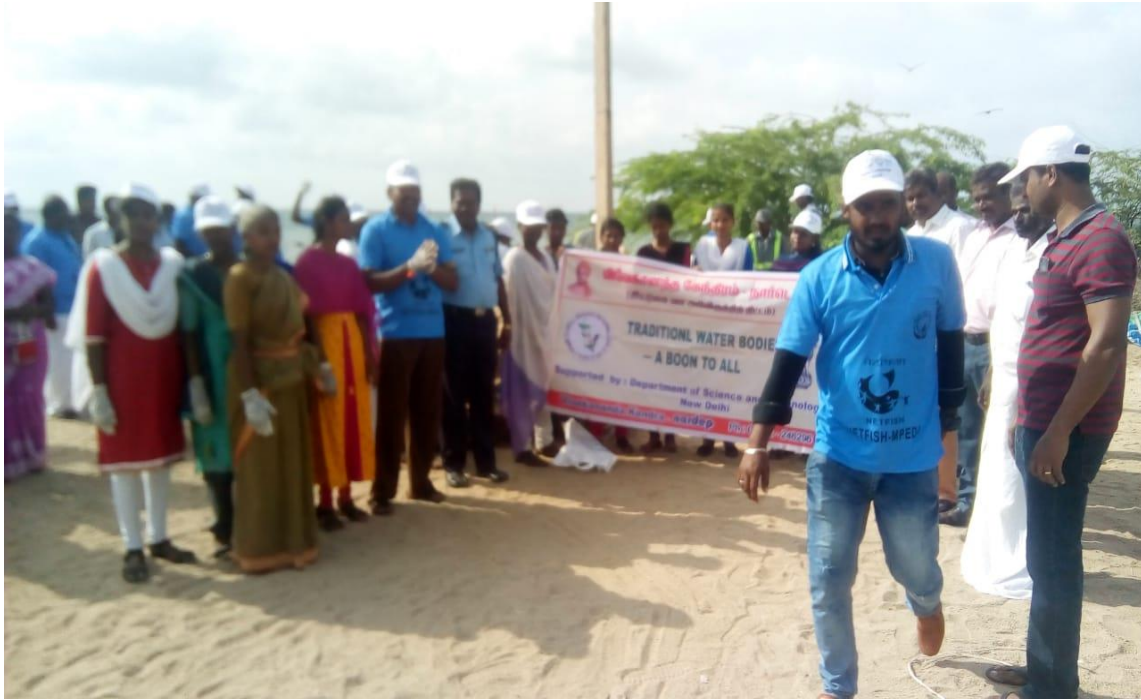
Olaikuda beach clean- up activity