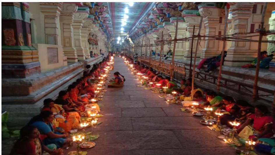
Deepa pooja conducted in the world famous Third Corridor of Sri Ramanathasamy Temple, Rameswaram