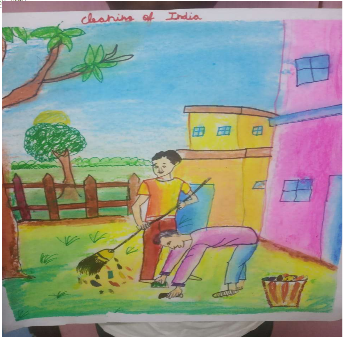
B.Madesh, 7 th Std, Kumbakonam